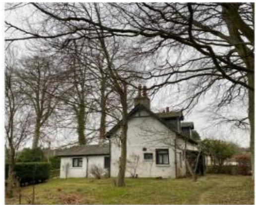
Rear (South Facing) Elevation SITE IMAGES