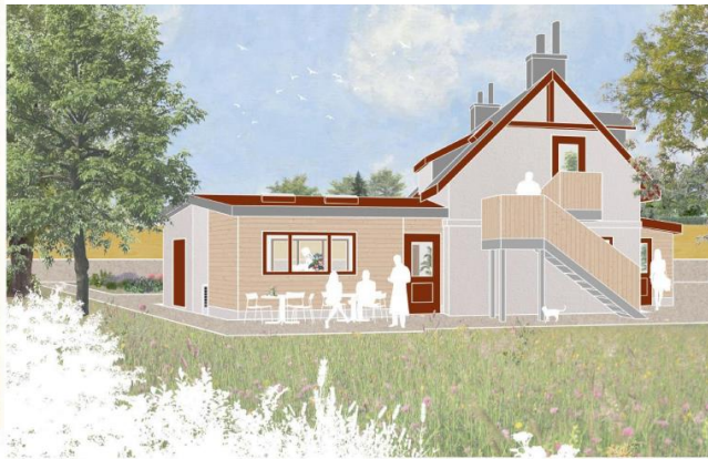
Camphill Schools Aberdeen Design Statement for Social Enterprise projec