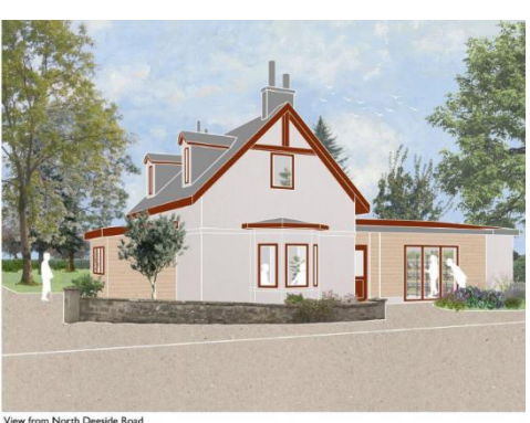
Camphill Schools Aberdeen Design Statement for Social Enterprise project